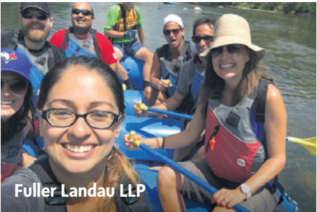
Fuller Landau LLP