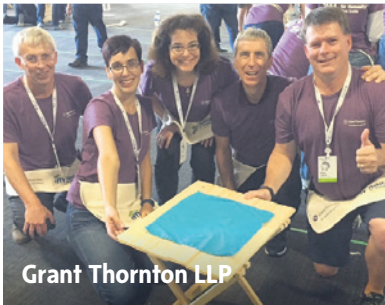
Grant Thornton LLP