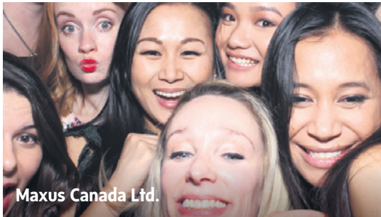
Maxus Canada Ltd.