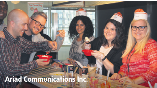
Ariad Communications Inc.